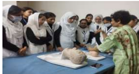
Training of Students of GNM and BSc Nursing of BEE ENN Nursing Institute, Jammu .