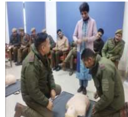
4 th batch