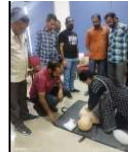
2 nd batch