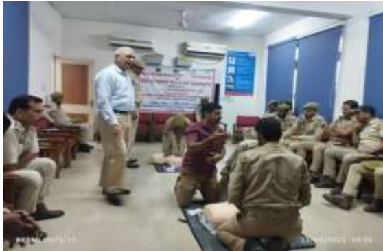
Training of Police Personnel.

The initiative "Save Life Jammu" started one year back by Directorate of Health Services Jammu on 23 rd January 2022 with the objective to increase the chances of survival by stabilizing the patient through timely intervention and optimal care in Golden hour in the Emergency Resuscitation Rooms. Besides treating patients in Emergency Rooms, skill development trainings of health employees, staff from other departments and volunteers are being conducted on regular basis at Jammu Skill & Simulation Centre Nagrota by Master Trainers. These trainings aim to strengthen the skills of the trainees while handling emergency as first responder at their work place. JSSC is fully accredited State-of-the-Art Medical training facility that incorporates Simulation based education, highlighting the commitment of the institution in providing cutting edge technology in the field of healthcare. The Skill & Simulation Centre is committed to supporting and participating in offering quality education to individuals and assisting in their preparation to be effective and compassionate healthcare providers in accordance with standards established Nationally.