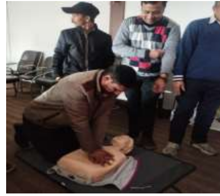
2 nd batch