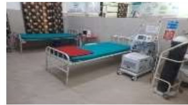
CHC Nagri Parole