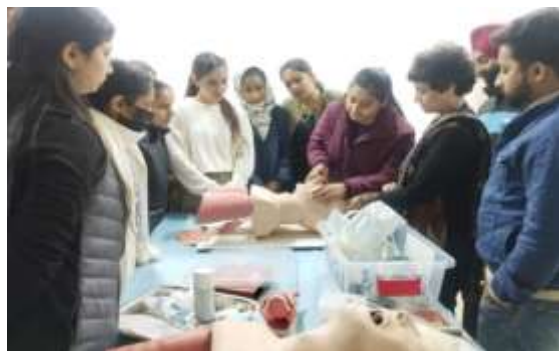
2 nd batch