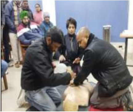
1 st batch