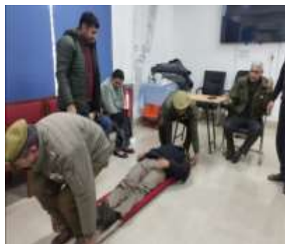
2 nd batch