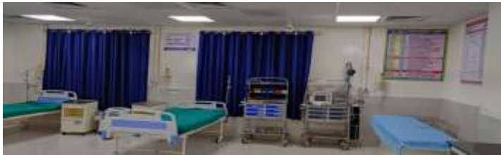
Rajiv Gandhi Hospital Gangyal