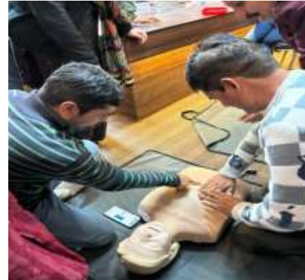
3 rd batch