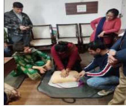
1 st batch