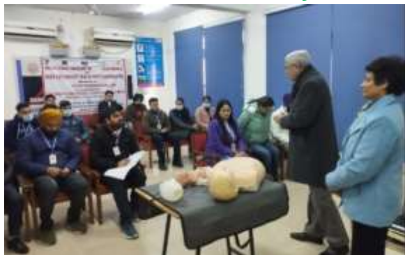
1 st batch