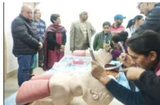
3 rd batch

BLS training of Police personals of Ramban District in 4 batches organized from 30 th January to 2 nd February 2024