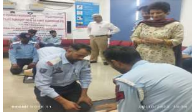
Training of Traffic Police Personnel.