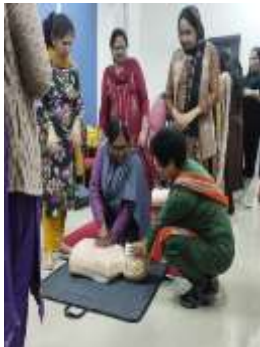
Training of FMPHW (Jammu Division)