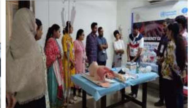
Training of newly appointed Medical Officers.