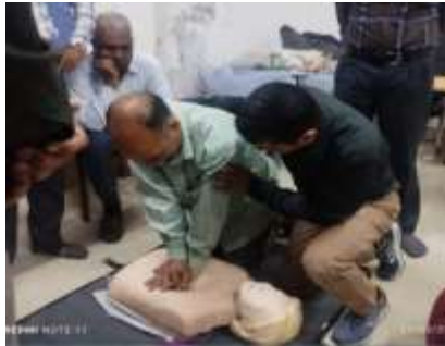
1 st batch