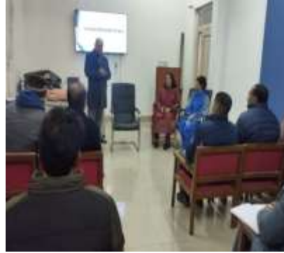
2 nd batch