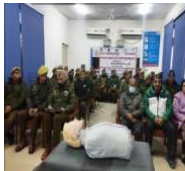
3 rd batch