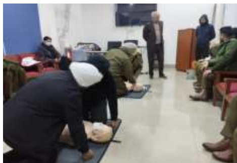
1 st batch

BLS training of Police personals of Ramban District in 4 batches organized from 30 th January to 2 nd February 2024