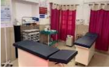
Govt. Hospital Gandhi Nagar