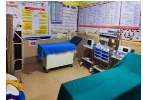
CHC Kandi, district Rajouri