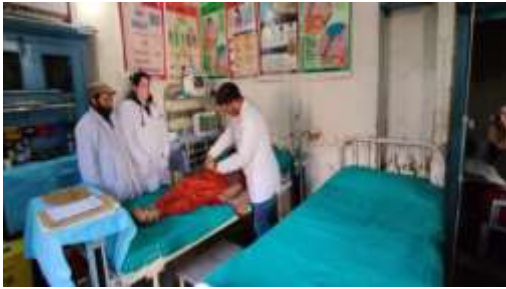
CHC Marwah, district Kishtwar