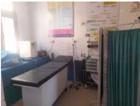
PHC Tikri, district Udhampur