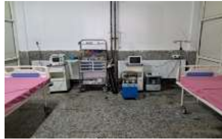
SDH Paddar, district Kishtwar