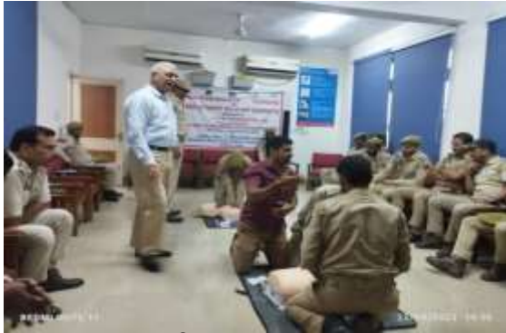
Training of Police Personnels.

The initiative "Save Life Jammu" started one year back by Directorate of Health Services Jammu on 23 rd January 2022 with the objective to increase the chances of survival by stabilizing the patient through timely intervention and optimal care in Golden hour in the Emergency Resuscitation Rooms. Besides treating patients in Emergency Rooms, skill development trainings of health employees, staff from other departments and volunteers are being conducted on regular basis at Jammu Skill & Simulation Centre Nagrota by Master Trainers. These trainings aim to strengthen the skills of the trainees while handling emergency as first responder at their work place. JSSC is fully accredited State-of-the-Art Medical training facility that incorporates Simulation based education, highlighting the commitment of the institution in providing cutting edge technology in the field of healthcare. The Skill & Simulation Centre is committed to supporting and participating in offering quality education to individuals and assisting in their preparation to be effective and compassionate healthcare providers in accordance with standards established Nationally.