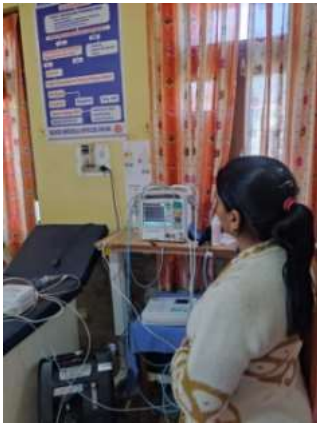
PHC Pouni, district Reasi