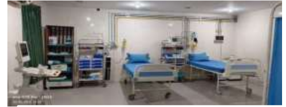
Govt. Hospital Sarwal