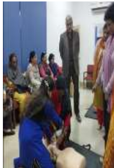
Training of FMPHW (Jammu Division)