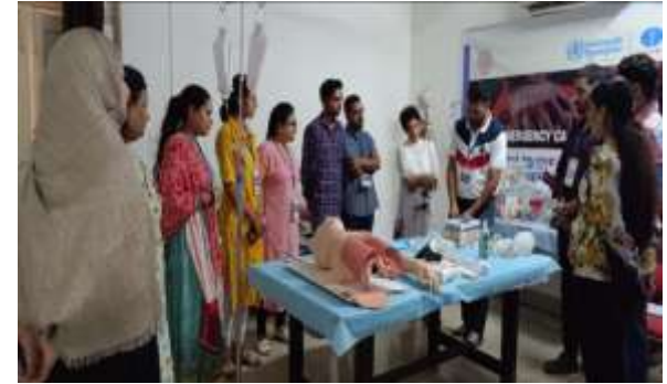
Training of newly appointed Medical Officers.