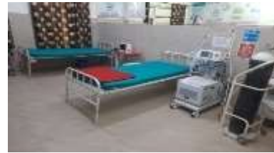
CHC Nagri Parole