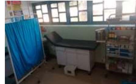
PHC Dansal, district Jammu