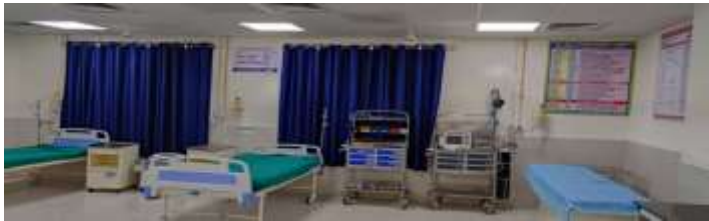
Rajiv Gandhi Hospital Gangyal