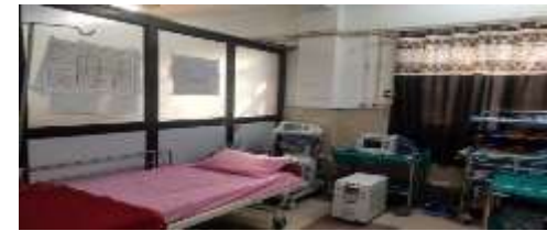
SDH R S Pura