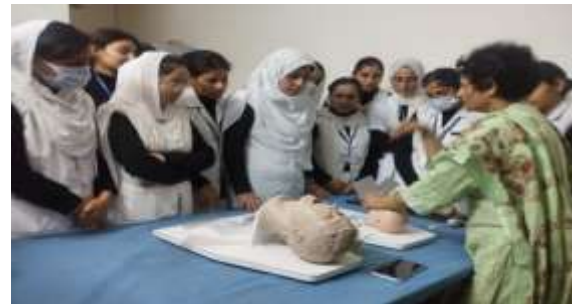
Training of Students of GNM and BSc Nursing of BEE ENN Nursing Institute, Jammu .