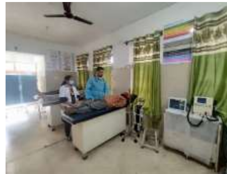
PHC Latti, district Udhampur