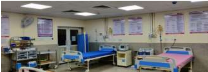
SDH Kot Bhalwal