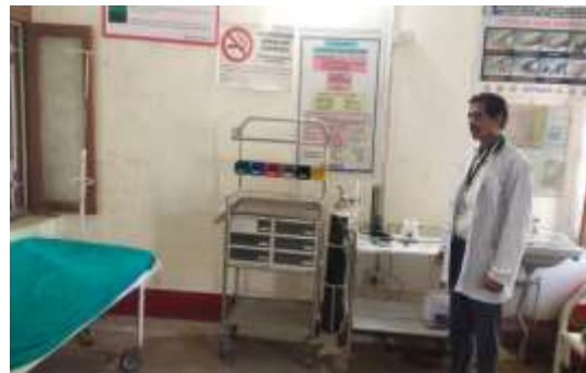
PHC Majalta, district Udhampur